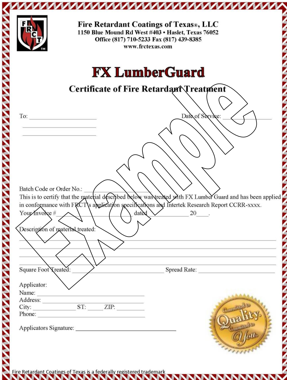
Figure 1 – Example of Certificate of Treatment (field application)